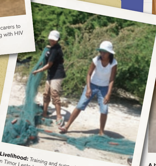
Livelihood: Training and support for young people in Timor Leste has helped this group set up their own fishing endeavour, providing food for their families and much needed income.