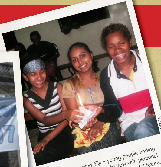
Peace: Peace training, Fiji – young people finding creative and non violent ways to deal with personal and community problems to build a peaceful future.