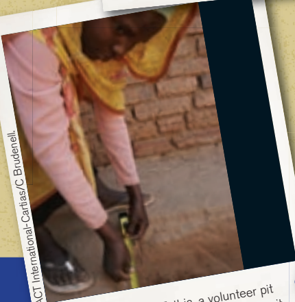
Health & Hygiene: Fathia, a volunteer pit latrine project coordinator, measures the pit depth to ensure it is the 6 metres needed.