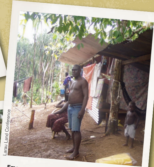
Larau Land Conference