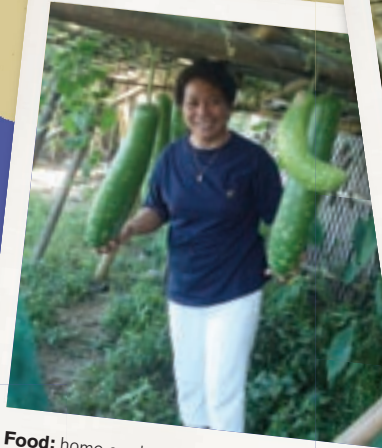
Food: home gardens in the Philippines help women improve family nutrition, health and income through vegetable selling.