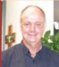
From the National Director