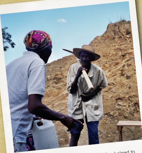
Empowerment: In Haiti, people are being helped to identify their own needs and find manageable solutions, like this elderly woman demonstrating the pressure of providing food for the family amidst so much poverty.