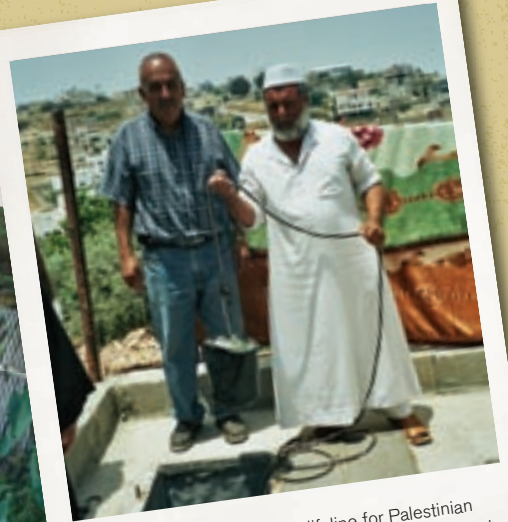
Water: Wells are providing a lifeline for Palestinian families in a Middle East Council of Churches' project that helps people grow their own food.