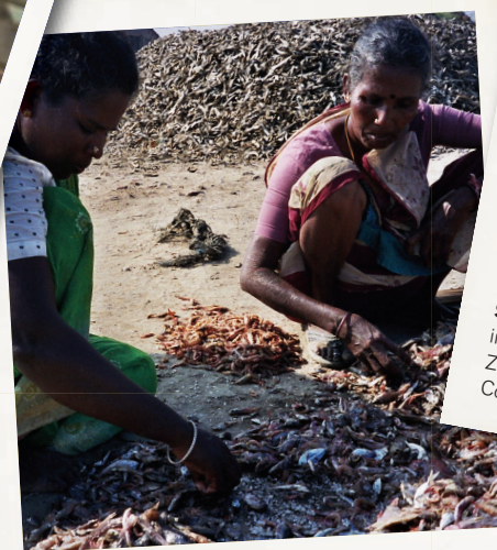
Women: Giving women a voice in their own future and helping them protect their environment and sources of livelihood in Tamil Nadu, India.