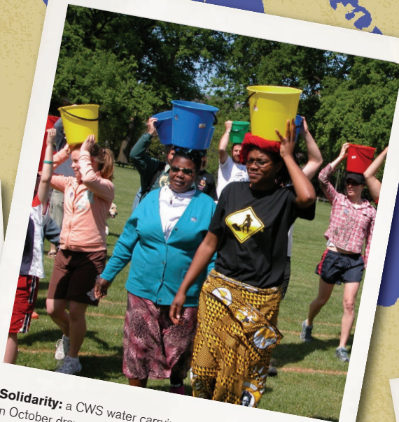
Solidarity: a CWS water carrying challenge in Christchurch in October draws attention to the difficulties facing Zimbabwean families and the importance of the Zimbabwe Council of Churches' rain water harvesting programme.

CWS and its partners work at many levels to provide support for the basic necessities of life, training for people to change their own lives, action on the global issues that keep people poor and most importantly solidarity with people world wide in their struggles and hopes for a better future. Thank you to everyone who makes this work possible.