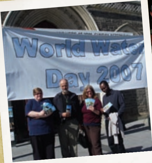
Campaigning: CWS campaigns on people's rights to water, food sovereignty, fair trade, peace and just livelihoods, and is the lead agency in New Zealand for the movement to cancel the crippling debt of developing countries.