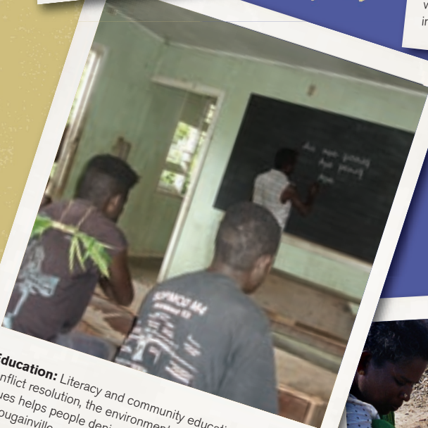
Education: Literacy and community education on health, conflict resolution, the environment and other important issues helps people denied an education during the conflict in Bougainville.