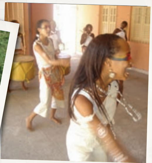
A better future: Young girls from the streets and slums of Recife, Brazil, celebrate their new opportunities for safety, education, vocational training and personal support.