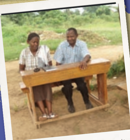
HIV & AIDS: Volunteers train as home carers to provide support and care to people living with HIV and AIDS, Uganda.